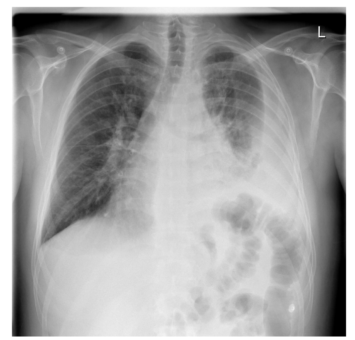
Figure 1 A chest radiogram showing large left pleural effusion

A week later, the patient was again admitted to the Department of Pulmonology with a temperature of 39.5 \,^{\circ} C and pain in the left side of the chest. Extensive left pleural effusion was established (Figures 1 and 2). On two occasions, thoracocentesis was performed, removing 900 and 600 mL of pleural effusion-type exudate. Treatment with piperacillin/tazobactam 4.5 g i.v. every 8 hours was started, but the fever persisted. We performed two additional thoracocenteses,