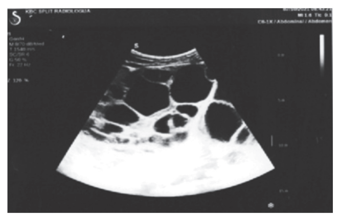
Figure 1b Left hemiabdomen entirety filled with multiple cystic septated formations