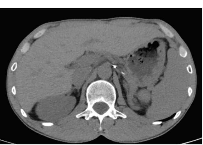
Figure 3 Postoperative contrast-enhanced MSCT of the abdomen and pelvis without cystic lesion 12 months after surgery

Figure 2 Contrast-enhanced MSCT of the abdomen and pelvis with cystic lesion in the liver and multiple lesions in the left hemiabdomen